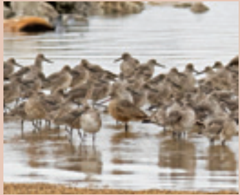
Lakeshore State Park

FWSP hosts several Work*Play*Earth Day events in April and May, and this year's Earth Day is extra special — the 50th anniversary! Volunteers at Earth Day events help the parks by cleaning up picnic and campground areas, planting trees, clearing park trails and removing invasive species such as garlic mustard. The Friends Groups typically provide lunches to say thanks to everyone who has volunteered for the day. Trail-building crews also are out getting the park trails ready for summer users. Many volunteers even "adopt a trail" and do regular trail work throughout the year.