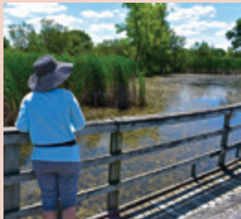
Richard Bong State Recreation Area

Wisconsin's state parks and forests feature many reservable shelters and are popular places to hold family reunions, birthday parties and weddings. During summer, many Friends Groups sell concessions and offer rentals for canoes, kayaks, boats and bicycles. Firewood and ice also are often sold by Friends Groups, with proceeds benefiting the property. If you're exploring the Wisconsin State Park System and need equipment or supplies, be sure to check out what Friends Groups can offer.