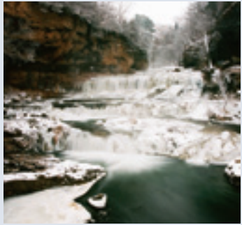
Willow River State Park

Friends Groups sponsor many winter candlelight events. These popular activities may include lighted trails for cross-country skiing, snowshoeing and hiking. There are usually fires for warming up and the Friends Groups often sell concessions, with proceeds benefiting the parks. All winter long, the Friends may help with cross-country ski clinics, races and other special events, and assist park staff in grooming trails.