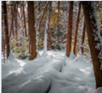
Logan Creek State Natural Area

The Friends of Wisconsin State Parks offer a convenient way to purchase state park admission stickers and state trail passes as part of gift packages through the online store at FWSP.org . You also can renew your membership or join a Friends Group near you. January is a great time to head "OutWiGo" and enjoy winter — and it's never too early to start taking photos for FWSP's annual photo contest!